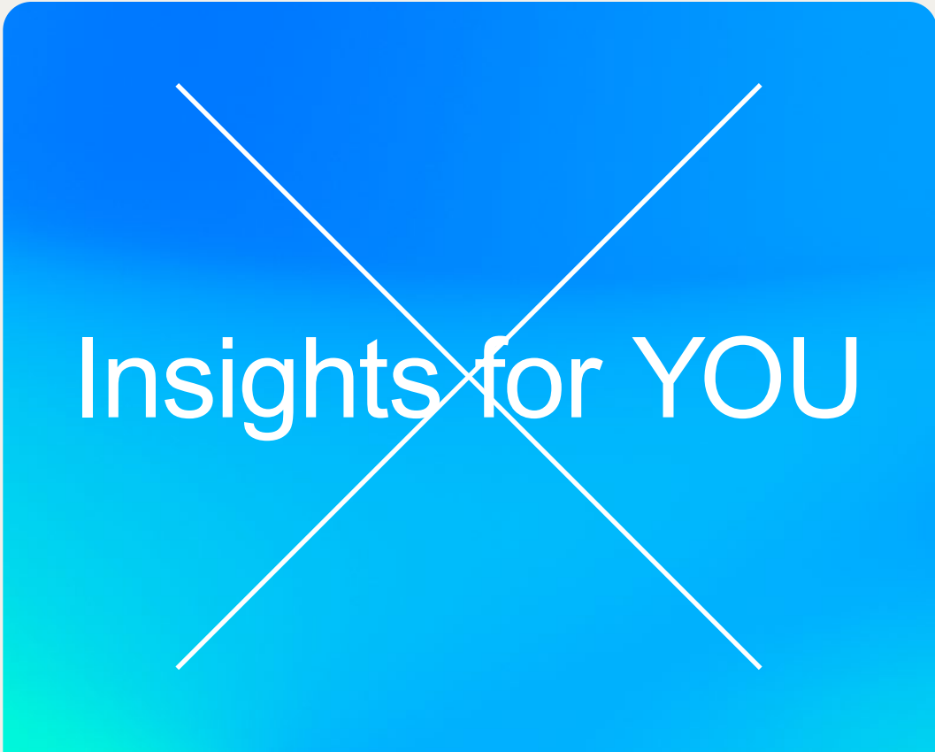
Do not use upper case