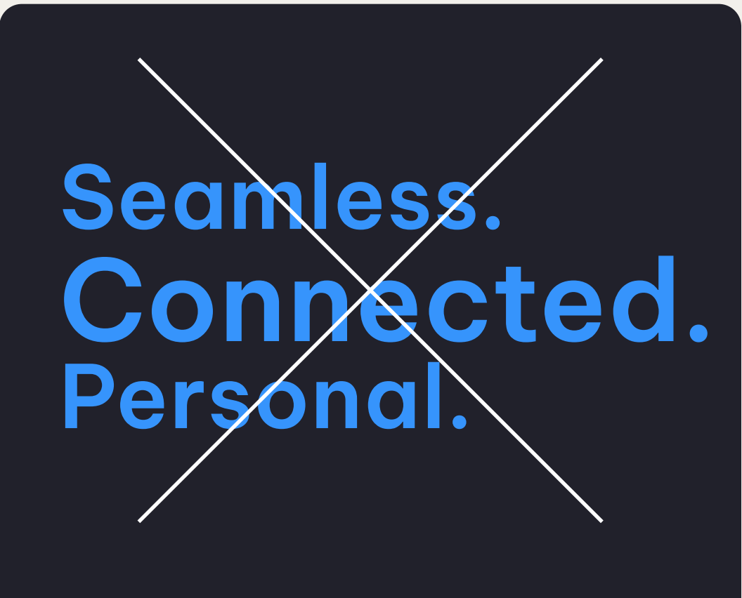
Do not use multiple text sizes within one headline