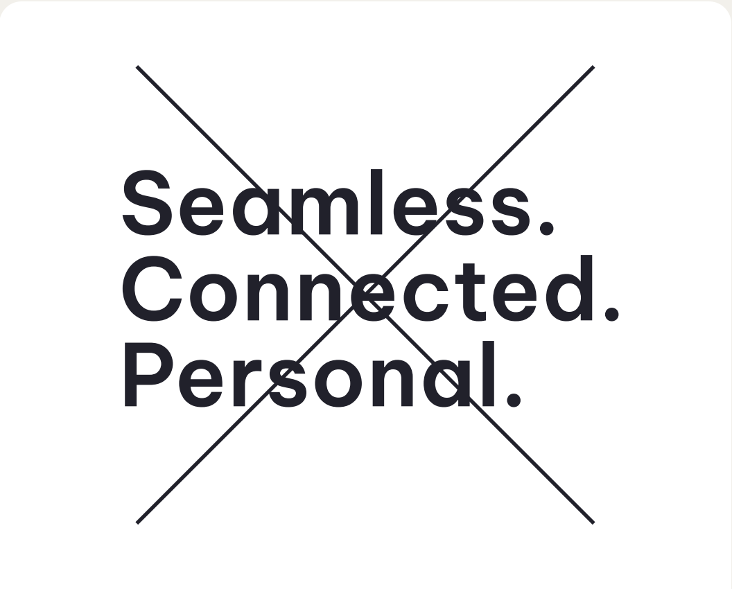
Do not use different tracking settings to those outlined in this document