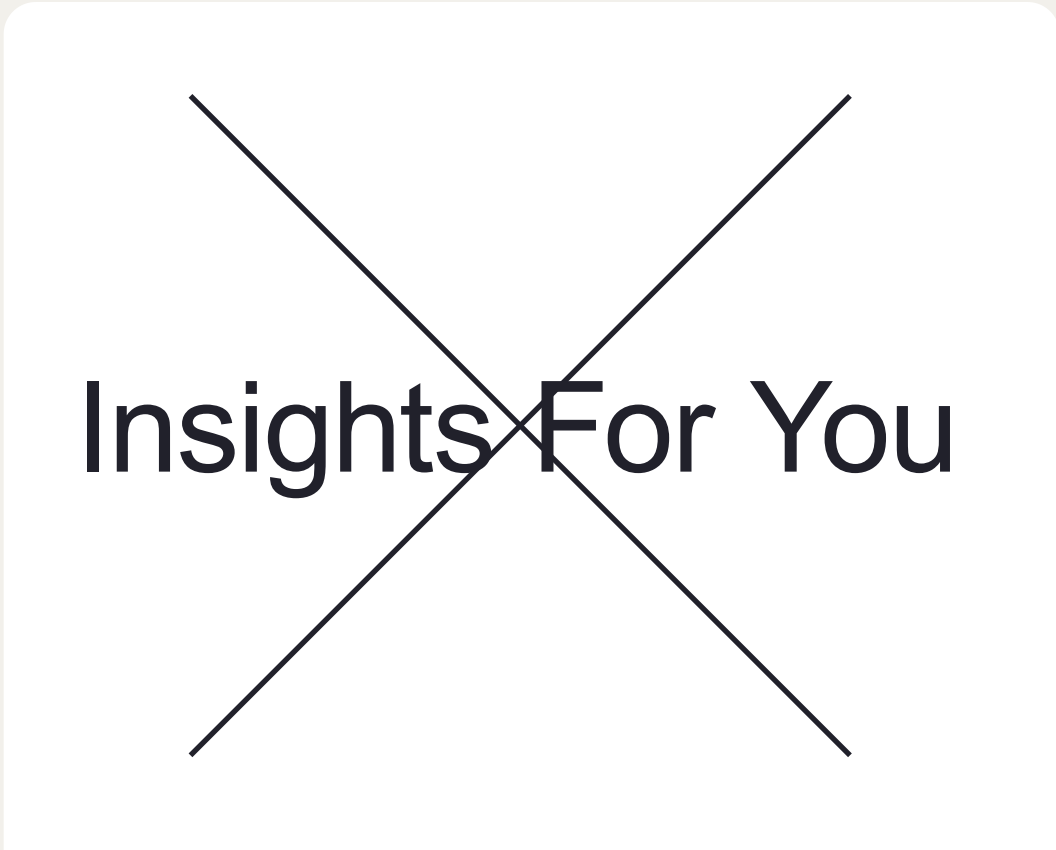
Do not use title case