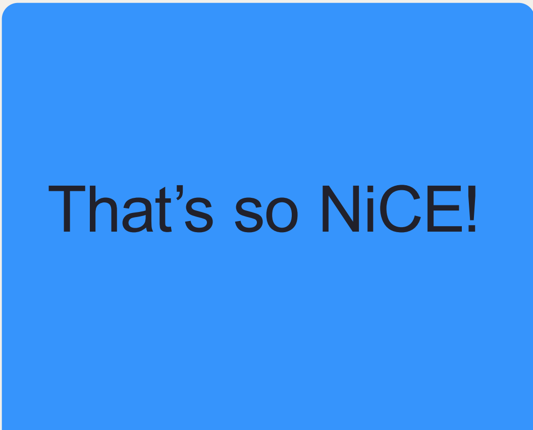
Do always write the name NiCE in copy with capital N, C, E and a lowercase i